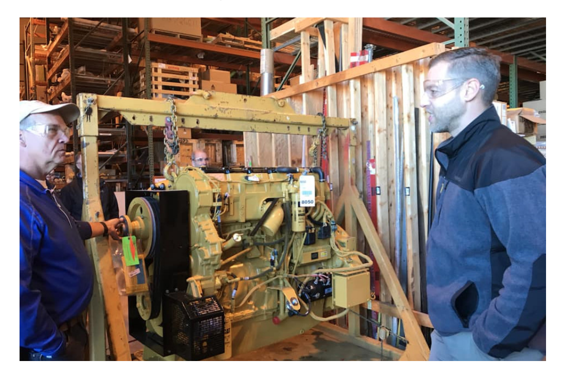
On October 16, MNFEA members enjoyed an exclusive behind-the-scenes tour of operations facilities in the South Metro.

Enjoying a full day of networking and connecting with event operators throughout Minnesota, event attendees visited the operations facilities of Biffs, Inc., TVG Events & Ziegler Power Systems. The facility tours provided insight into these important elements of event production and answered compelling questions about what happens behind-the-scenes of these crucial event services.